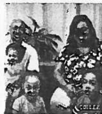
Friends of NJ Parent Link 06:48