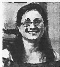
Welcome to NJ Parent Link 01:02