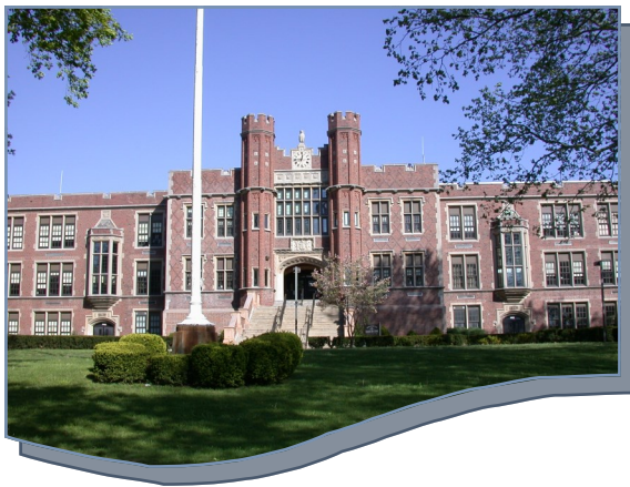
Teaneck High School