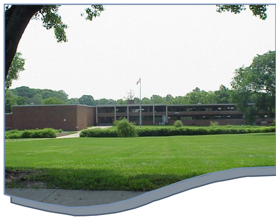
Thomas Jefferson Middle School