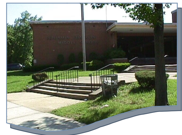
Benjamin Franklin Middle School