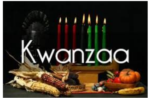
December 26-January 1, 2022