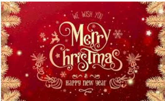
December 25th & January 1, 2022