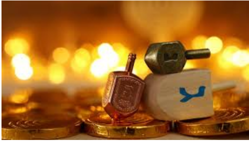
November 28-December 6, 2021